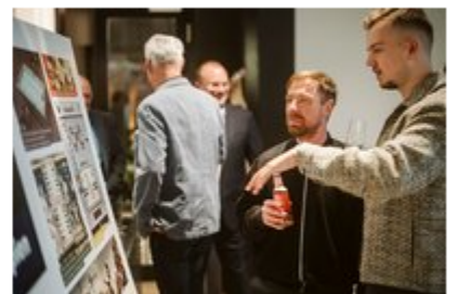
Die Autoren lasen ausgewählte Passagen vor und führten durch eine Vernissage, die die Themen des Buches künstlerisch reflektierte.