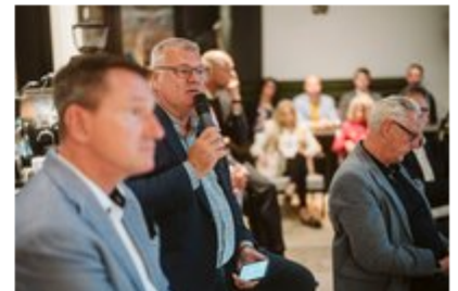
Rund 40 Gäste aus Politik, Medien und Public Affairs kamen zur Buchvorstellung in Berlin.